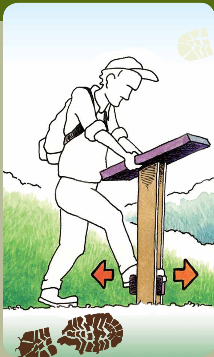
Illustration: University of Wisconsin Extension

Shoes can carry the seeds of invasive plants like Glossy Buckthorn ( Frangula alnus ). Please brush them off before entering and leaving this area.