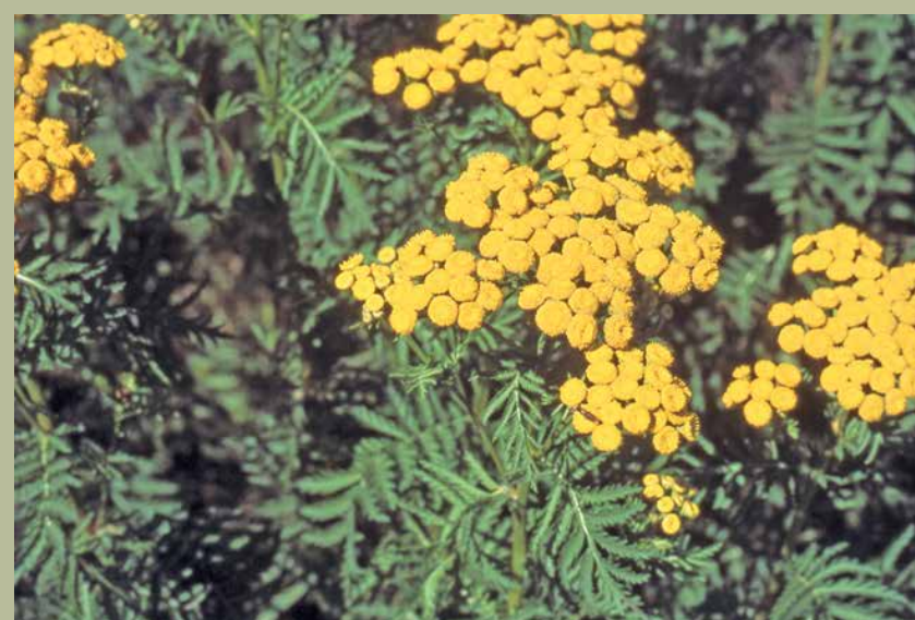
Common Tansy ( Tanacetum vulgare )

Tansy thrives in disturbed areas, roadsides and streambanks.