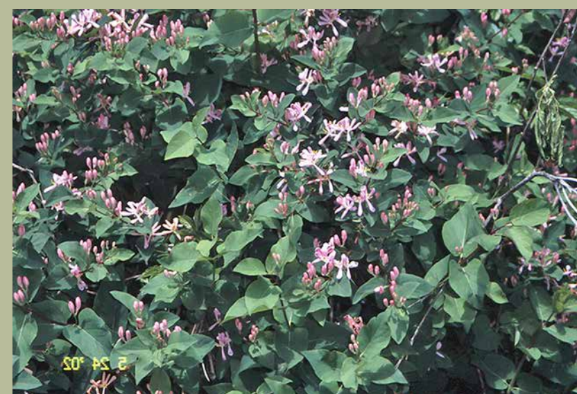
Exotic Honeysuckle ( Lonicera tataric and Lonicera morrowii )

Exotic honeysuckles are invasive because they have the ability to grow in a wide variety of habitats, even dense shade and wet soils.